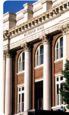
Universities and Schools...

As a result, The Metro Group has continued to develop a superior range of chemical programs, equipment, and technical services, designed to provide performance-based solutions for all kinds of facilities and industries.