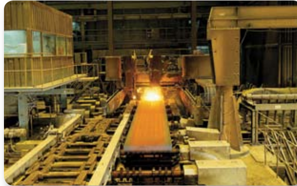
Assisting Factory Managers...

The Metro Group's service programs are designed to promote improved operating efficiency and energy reduction/conservation, extended equipment life, reduced downtime and increased plant safety.