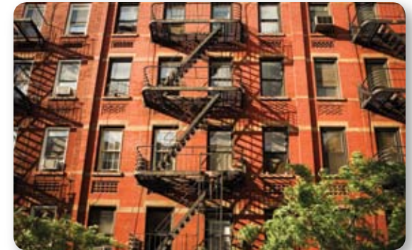
Apartment Building Managers...